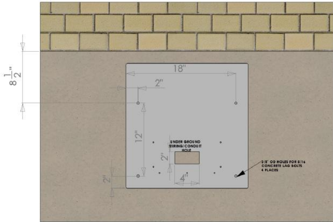
Figure 3: Pedestal Base Layout